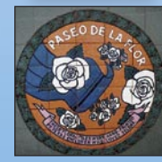
8 "Paseo De La Flor" • Aloe Tile Works. 1997, ceramic tile mural. Shoreline Blvd. and People St., downstairs below the Selena Memorial. A walkway of hand painted tiles by Texas children who loved Selena. Donated by Devary Durrill Foundation.