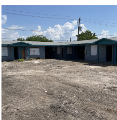
The Rex Motel - before & after