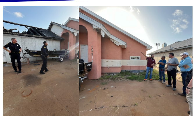
Contractor onsite meeting with CCPD & Code Compliance at 15218 Reales Dr. District 4