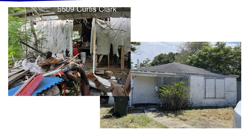
Curtis Clark before & after abatement

5509 Curtis Clark Dr Vacant Building - This property has an excessive amount of litter and solid waste onsite. An On-site bid warrant was served on 7/16/24 for phase 1 of the abatement process. We are awaiting the junk vehicle hearing, which is scheduled for 8/7/24 to be able to start phase 2 of the abatement process after vehicles behind gate are removed.